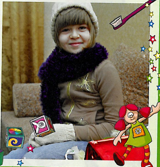
The power of a simple gift